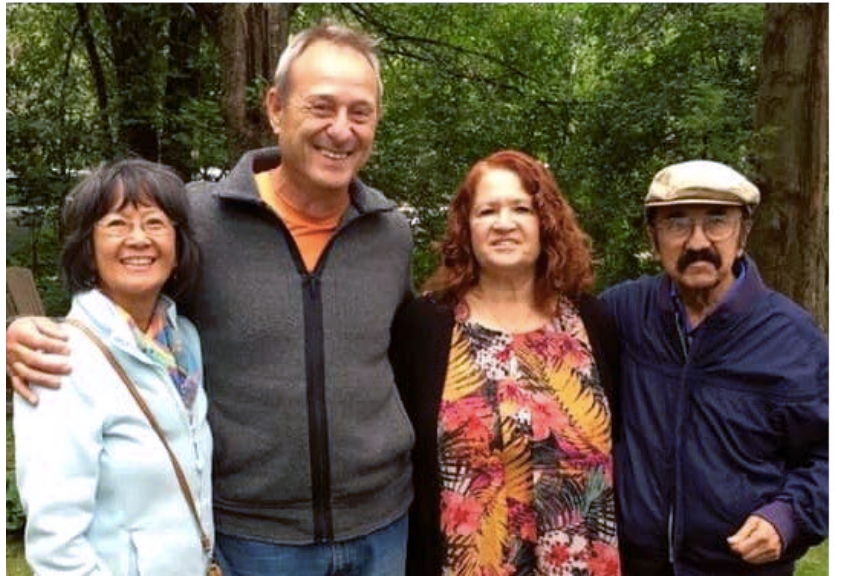
Chicago Jitterbug Club Picnic