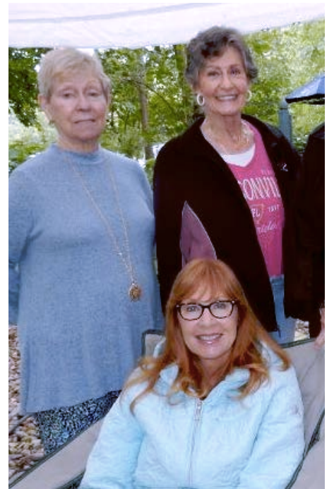
Waschkas' Wildlife Preserve – Palos Park